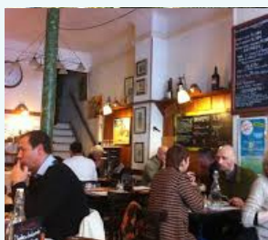
Déjeuner en Ville

* to be confirm for prices and disponibilities