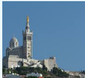
Notre Dame de la Garde